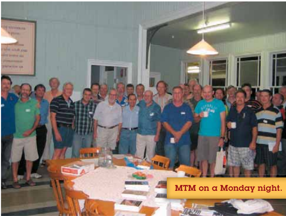
MTM on a Monday night.

There is also more depth to me, and I am able to be more present to others, without getting in the way. I am also more aware when I am running away, and I handle myself more lovingly and gently. I trust that I am doing that with others as well. MTM has been a great blessing for me.