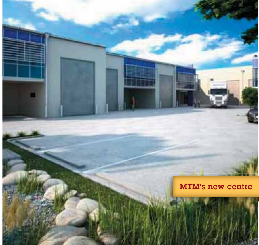
MTM's new centre

Phone: 07 3876 8710 Address: 5a 1 Swann Rd Taringa Queensland Australia 4068 Website: www.mtmaustralia.org.au